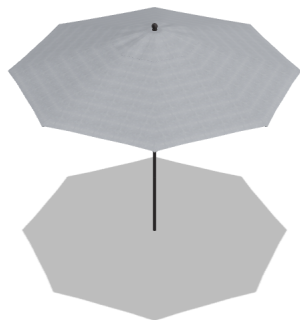
High Angle View