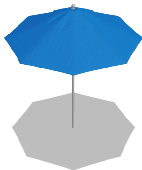
High Angle View