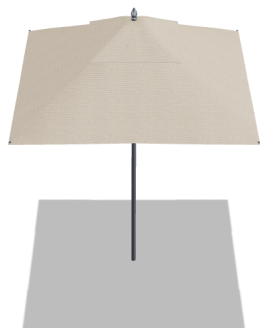
High Angle View